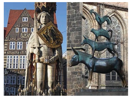
Roland and Bremen Town Musicians