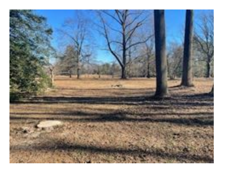
Site at Tyler Arboretum after tree removal

A Memorandum of Understanding between the parties was executed in January, tree removal has taken place in the designated plot, and a selection committee has been assembled. With a goal of propagating cultivars for the garden in the coming fall, the selection committee will be