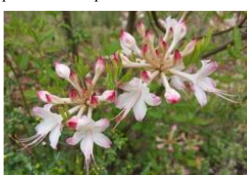
R. atlanticum 'Plyler's Paintbrush' has been added to the Jenkins collection.